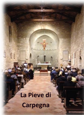
La Pieve di Carpegna