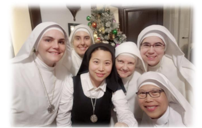
We love you all! Merry Christmas and a Blessed New Year!!!