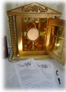
Signed consecration to the Eternal Father